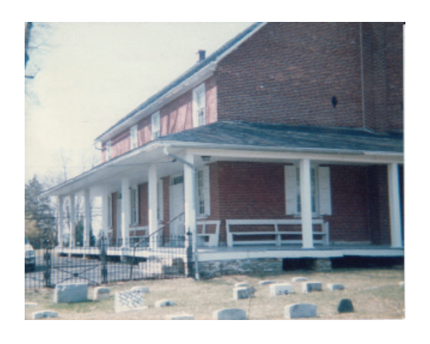
AKA Little Britain Preparative Meeting Indulged in 1749 Became a Preparative Meeting in 1761 Joined with Eastland Preparative Meeting to form Little Britain Monthly Meeting in 1804 Current Meetinghouse built in 1823