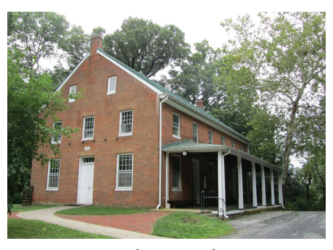
Began worshipping together 1753 Property gifted 1770 Brick Meeting House built 1817