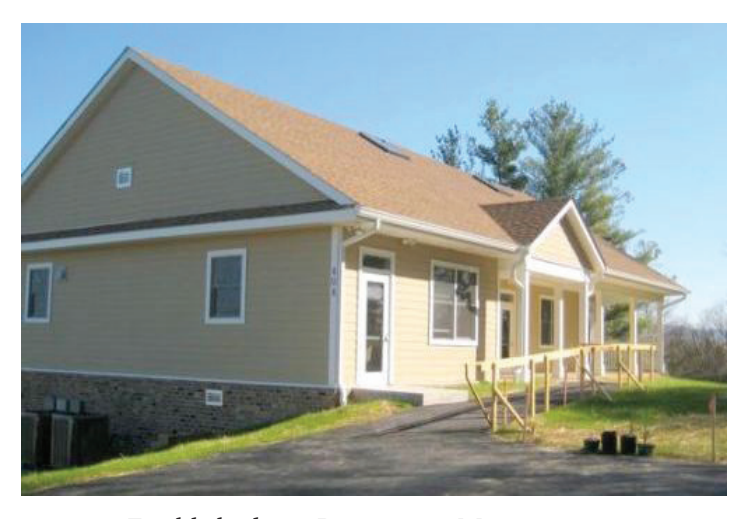
Established as a Preparative Meeting 1967 Became a Monthly Meeting 1992