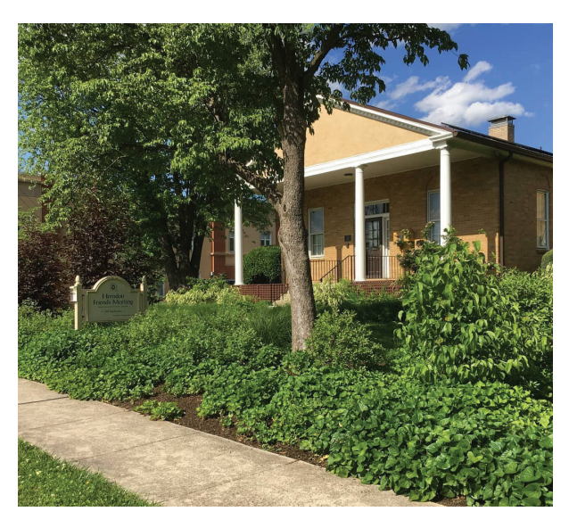
Began meeting 1974 Established Worship Group 1979 Became Preparative Meeting 1981 Monthly Meeting 1986 Purchased building 1995