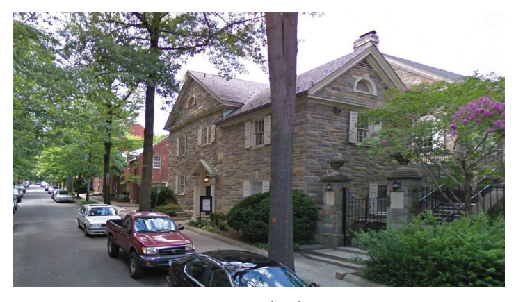
Meeting House built in 1930