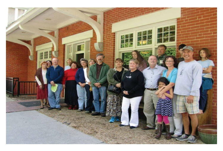
Established as Monthly Meeting 2012