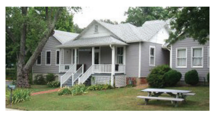
Established as a Worship Group 1938 Re-started 1952 Became a Monthly Meeting 1963