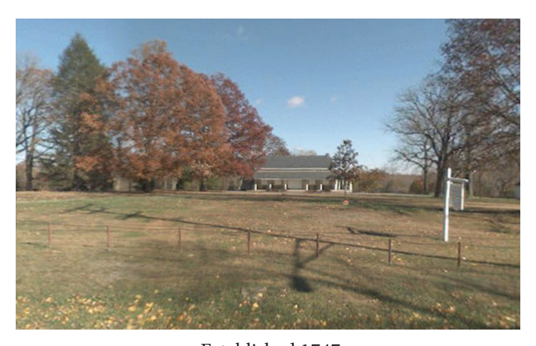
Established 1747 Became Monthly Meeting 1815 Current Meeting House built in 1843