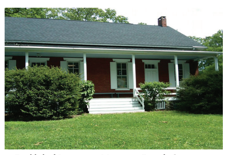
Established Preparative Meeting at Friends Grove 1748 Became Monthly Meeting 1780 Moved log meeting house 1848 Replaced log with brick meeting house 1884