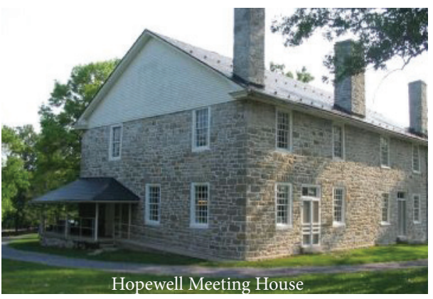
Established Worship Group 1734 Became Monthly Meeting 1735