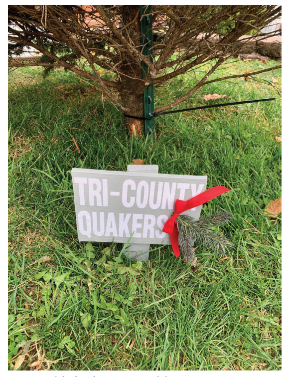
Established as a Monthly Meeting 2020