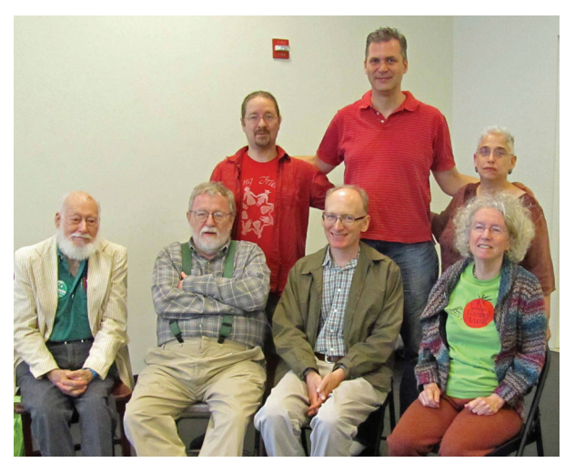
Formed Preparative Meeting 1991