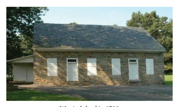
Was indulged in 1798 Became a Preparative Meeting in 1803 Joined with Little Britain Preparative (Penn Hill) to form Little Britain Monthly Meeting in 1804 Current Meetinghouse was built in 1803