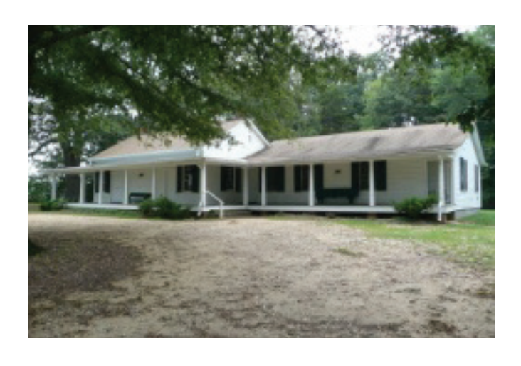
Meeting House built 1851