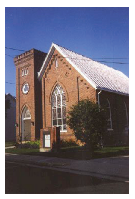
Established Preparatory Group 1983 Became Monthly Meeting 1986