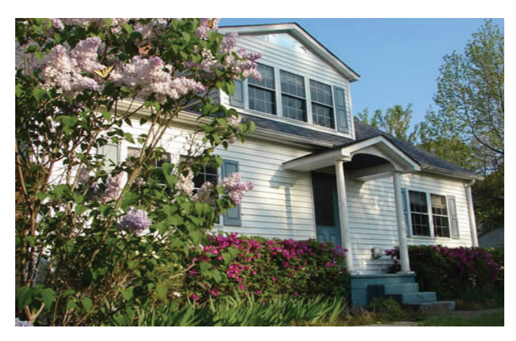
Evidence of Quaker presence in Calvert County 1724 Became Monthly Meeting in 1871; laid down 1942 Established Worship Group in 1980 Became Monthly Meeting in 1995 Purchase of Meeting House in 2001