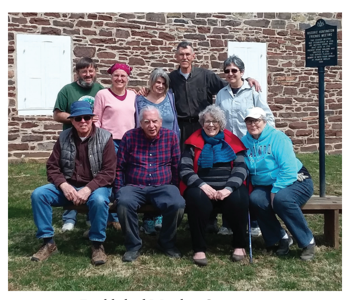
Established Worship Group 1739 Became Preparative Meeting 1761 Laid Down 1885