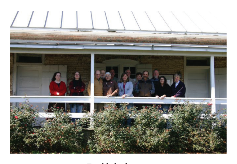
Established 1735 Became a Preparatory Meeting 1764 Monthly Meeting 1772