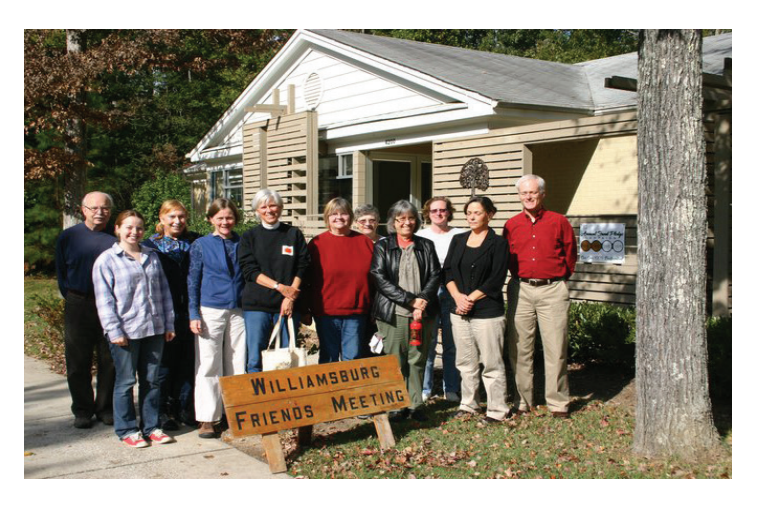
Established worship group 1981 Became Preparatory Meeting 1982 Monthly Meeting 1987