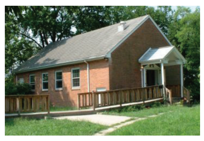
Established 1956 (merger of College Park and Washington Monthly Meetings)