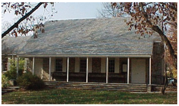
Established as Monthly Meeting 1792 present Meeting House built 1949