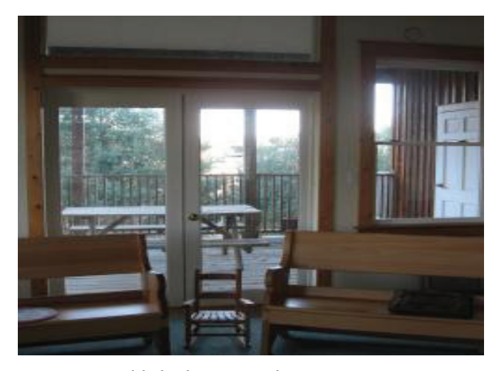
Established as a Worship Group 1991 Became a Monthly Meeting 1992