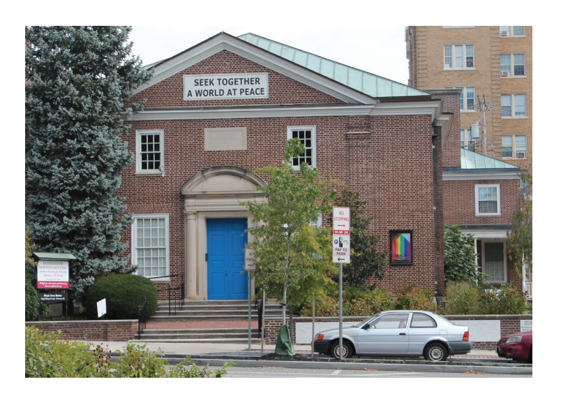
First Meeting for worship in current location 1922