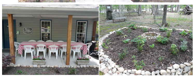
Established 1987 Became Preparative Meeting 1994 Monthly Meeting 1995