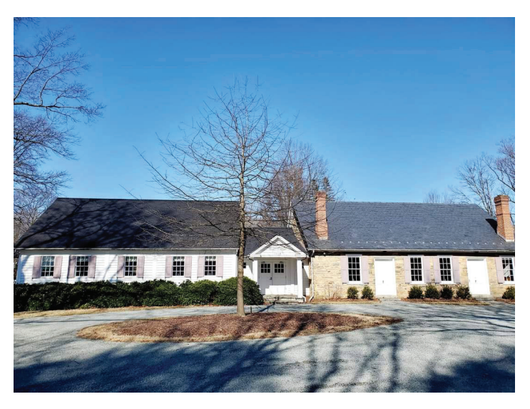
Established as a Preparative Meeting 1736 Became a Monthly Meeting 1760