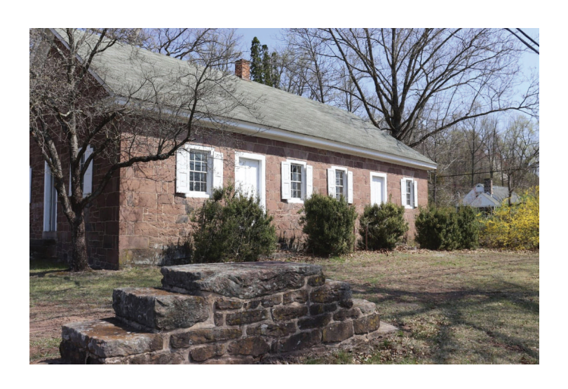
Established 1738 Became Preparative Meeting at Newberrytown 1739 Stone meetinghouse at Redlands 1811 Laid Down 1862