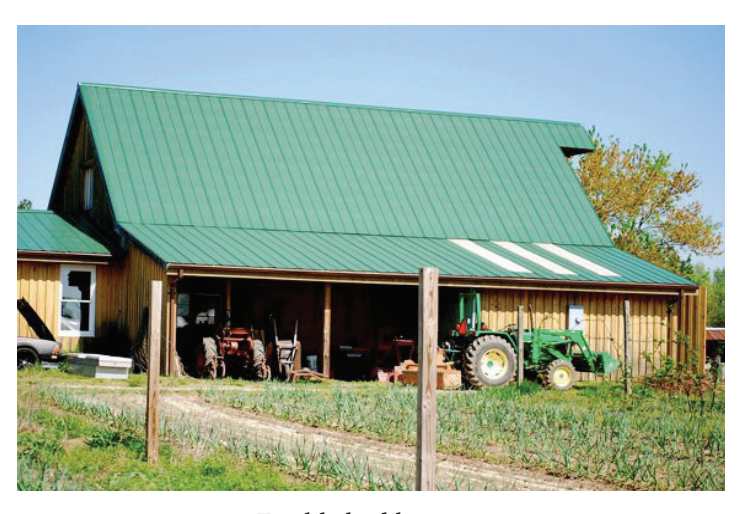
Established by 2002 Became Monthly Meeting 2012