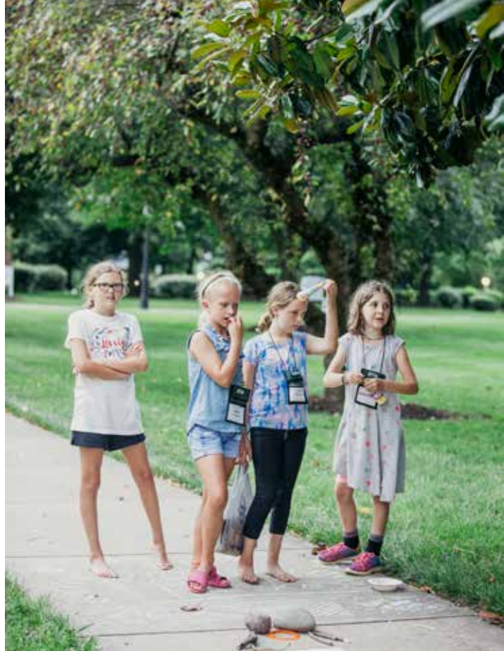
Annual Session 2018