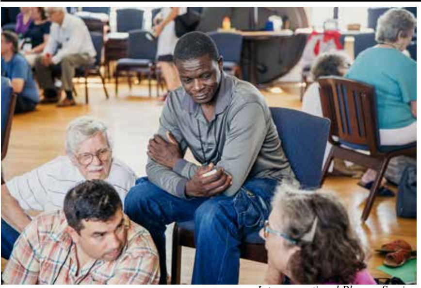
Intergenerational Plenary Session