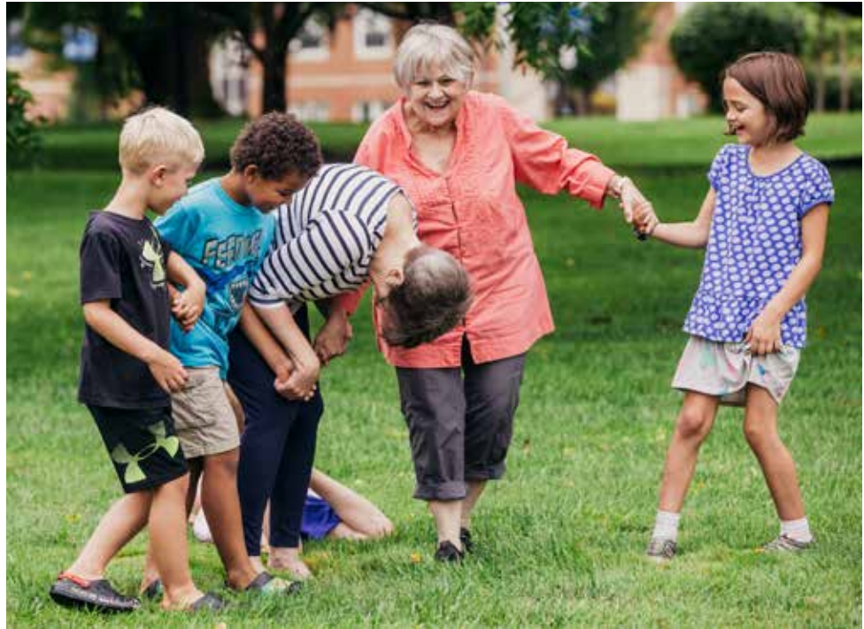
Annual Session 2018

people to gendered activities that align with their identities (if you can't eliminate gendered activities all together); provide resources and information that are affirming of trans and gender non-conforming people; keep trying, even when you mess up!"