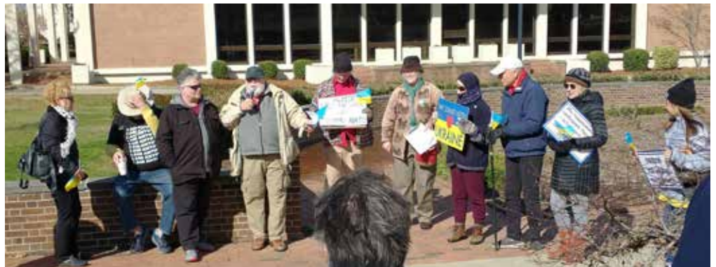
Quaker House Stand for Peace in Ukraine Event

Quaker House is thriving because of the support we receive from member meetings, other Quaker and like-minded organizations, and individuals. Baltimore Yearly Meeting contributes $200 annually and several local worshipping communities make significant contributions of their own. Charlottesville and Richmond Friends Meetings have been staunch supporters for many years. If you would like to follow and/or add to your support of our peace work, please visit the Quaker House website, Facebook page, Twitter or Instagram account.