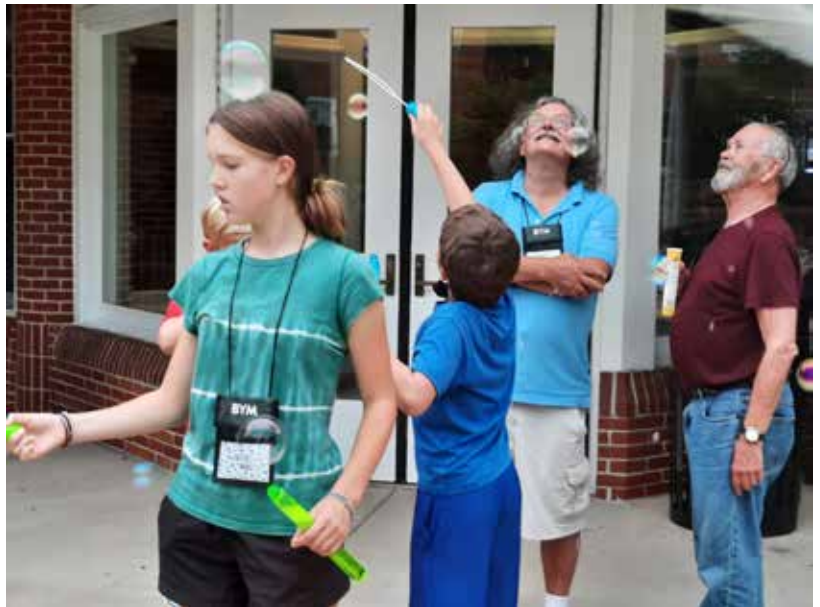
All Age Celebration at Annual Session 2022

We cosponsored four webinars and promoted them widely within BYM: Drone Warfare (organized by Annapolis Friends); Nuclear Weapons and What We Can Do, featuring activist and scholar