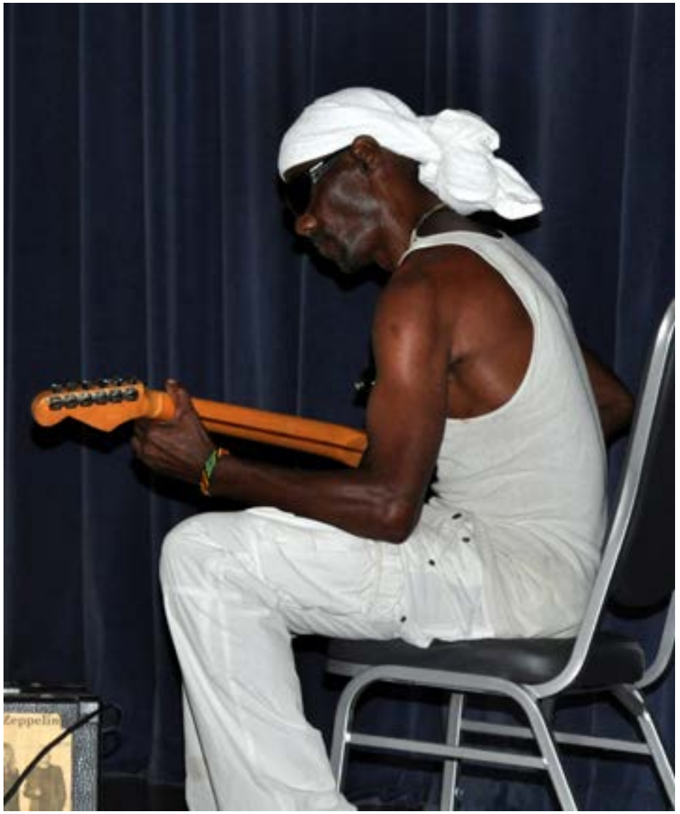
Coffee House Annual Session 2019