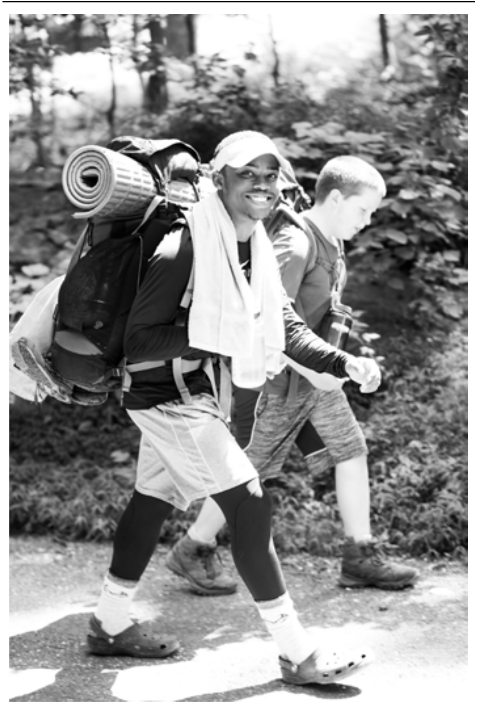
Catoctin Quaker Camp hikers