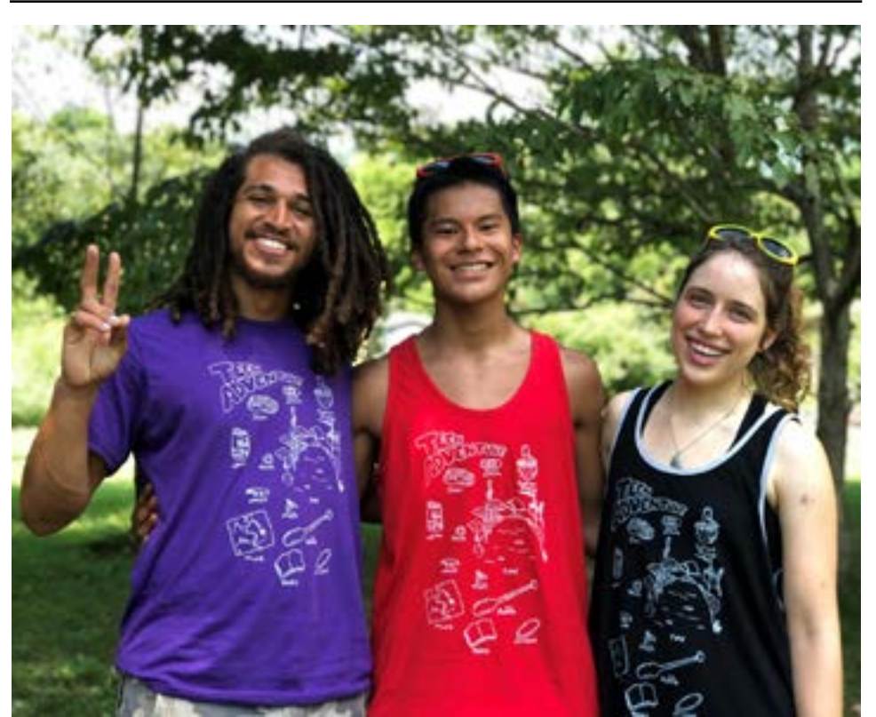
Teen Adventure Quaker Camp