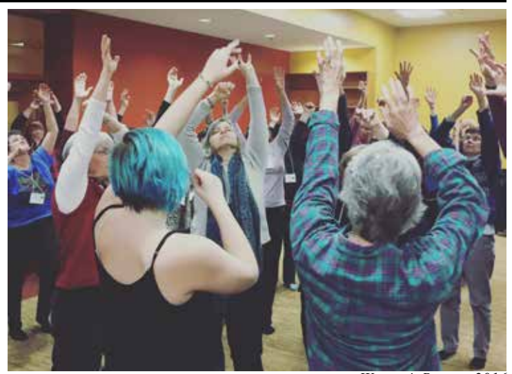
Women's Retreat 2016

The thoughtful and caring outreach of our Pastoral Care Committee to many young adult associate members has resulted in six young adults in our Meeting choosing to become full members. In addi-