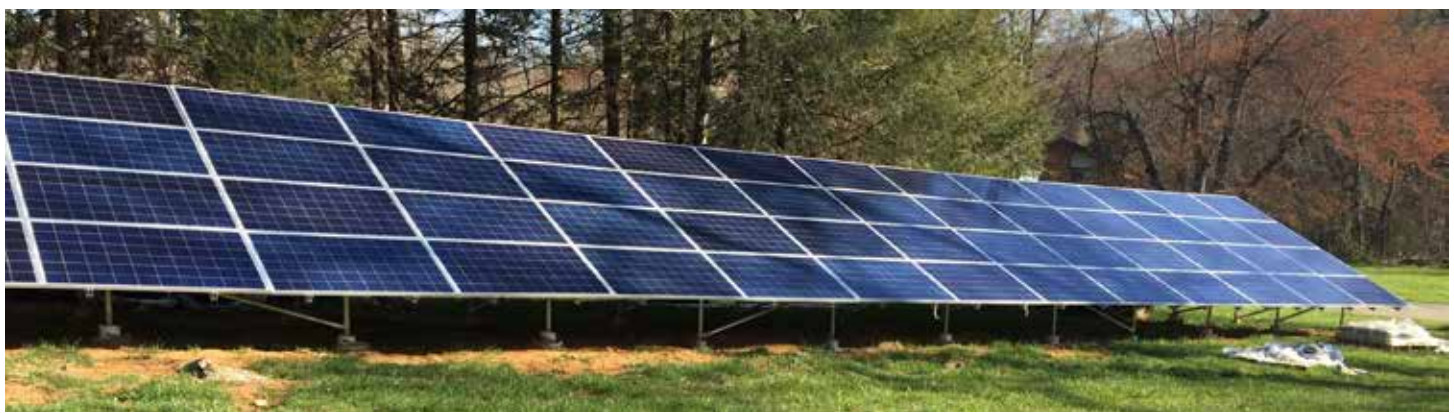
New solar panels at the Yearly Meeting office

I want to pose this query: What images, pictures, words, and/or scenes come to mind when thinking about a supportive and inclusive faith community?