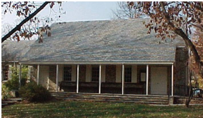
Established as Monthly Meeting 1792 Meeting House built 1781