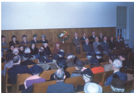
First meeting for worship Dec. 18, 1949