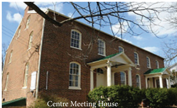
Centre Meeting House

Established Worship Group 1734 Became Monthly Meeting 1735