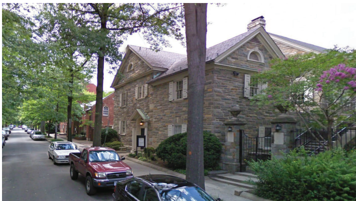
Meeting House built in 1930