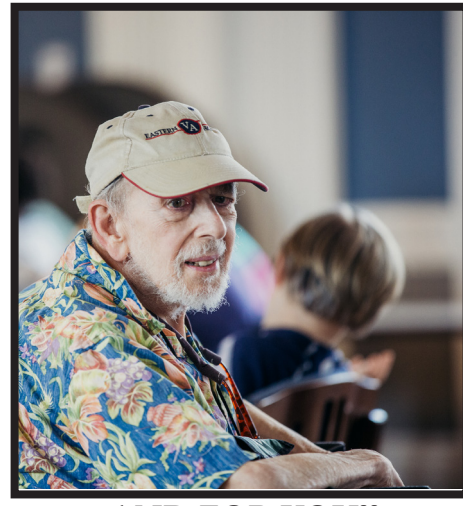
AND FOR YOU!!