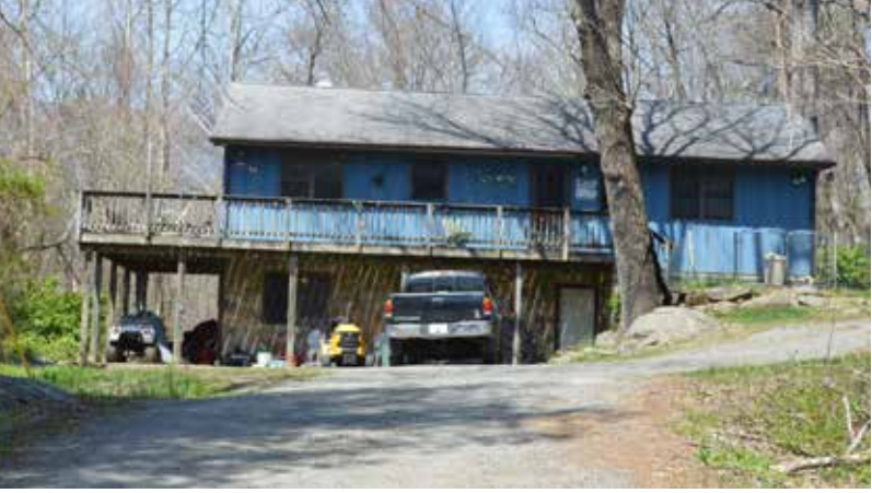
Shiloh Quaker Camp Caretaker's Residence (the Blue House)

Please apply before June 15, 2018. Our goal is to fill the position before July 15, 2018. A draft job description is available at <u>www.bym-rsf.org/what_we_do/committees/campproperty/caretakerjob.</u> <u>html</u> or a copy can be requested by emailing <u>campproperty@bym-rsf.org</u>.