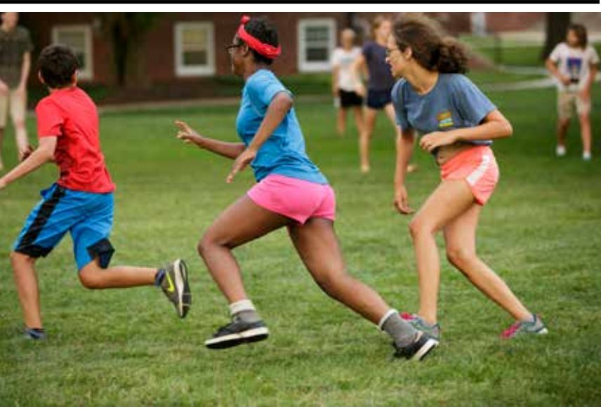
Capture the Flag at Annual Session 2017