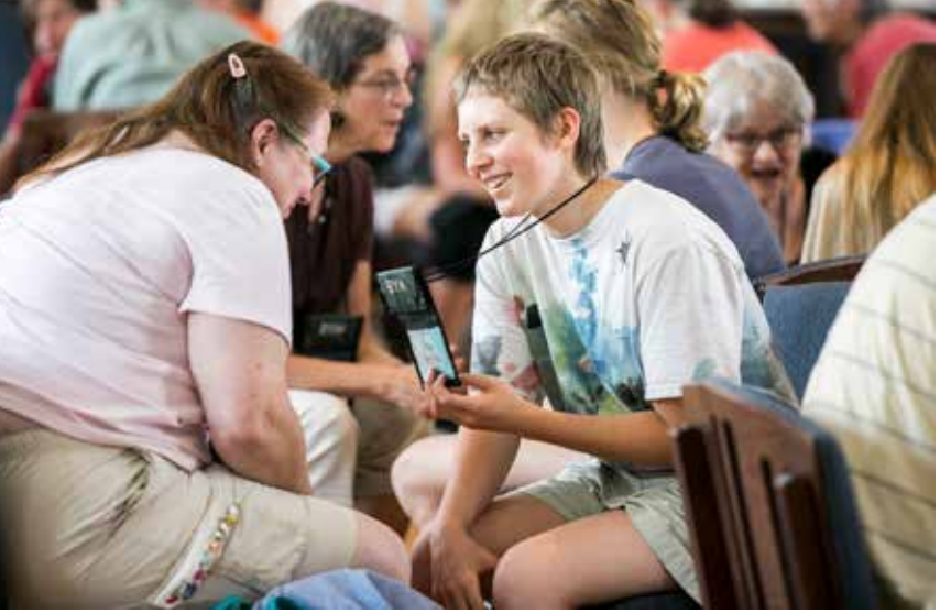
Multigenerational Plenary Session at Annual Session 2017