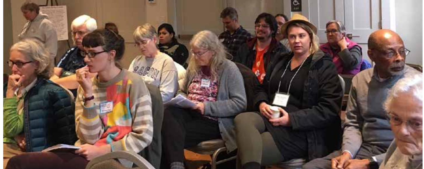
Eleventh Month Interim Meeting Diversity Workshop

For more information on the Growing Diverse Leadership initiative check out our webpage on the BYM website or go to the direct link <u>www.tinyurl.com/STRIDEon</u> to donate.