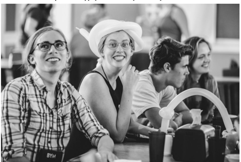
Annual Session 2016

Although the number of visitors was less than expected for the Bloom Art events, there was a steady flow of guests during Colonial Days. As a result the Meeting has welcomed several new visitors to Meeting for Worship.