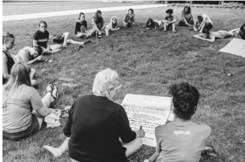
Annual Session 2016

We have also had many opportunities for service and engagement