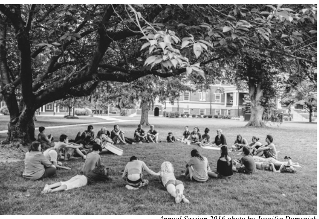
Annual Session 2016