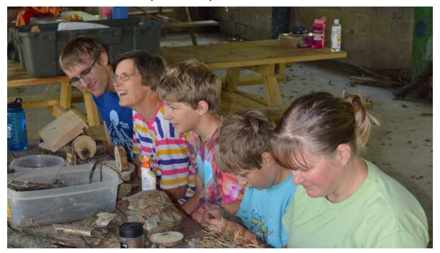
Friends, Family, Fun and Favorite Activities at the BYM Camps!

Family Camp Weekends at Baltimore Yearly Meeting Camp Properties offer us all a chance to enjoy our beautiful camp properties at a special time of year. Individuals and families are invited to spend the day or the weekend at camp. Each weekend will have a program coordinator who will plan camp-type activities for Saturday and Sunday mornings, as well as Saturday afternoon and evening. These may include things like playing in the creek, crafts projects or hiking around one of the most precious places on earth. There will also be plenty of work projects to do! Work projects offer people with all kinds of skills the opportunity to enjoy some meaningful and satisfying work! We will enjoy meals together, have time to explore and even spend some time around a camp fire in the evening. Come and enjoy a camp experience, give the gift of your time, participate with children in activities and find yourself rejuvenated.