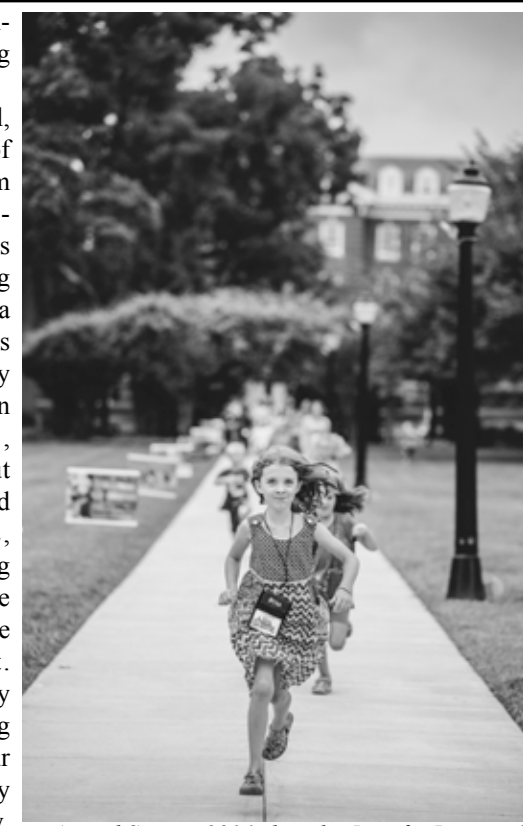
Annual Session 2016

found many people curious about and open to the message.