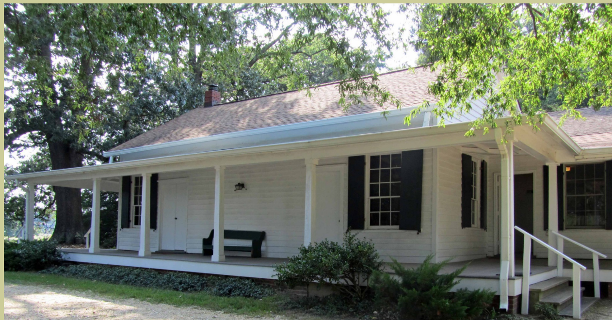
Woodlawn Meeting House, Fort Belvoir VA