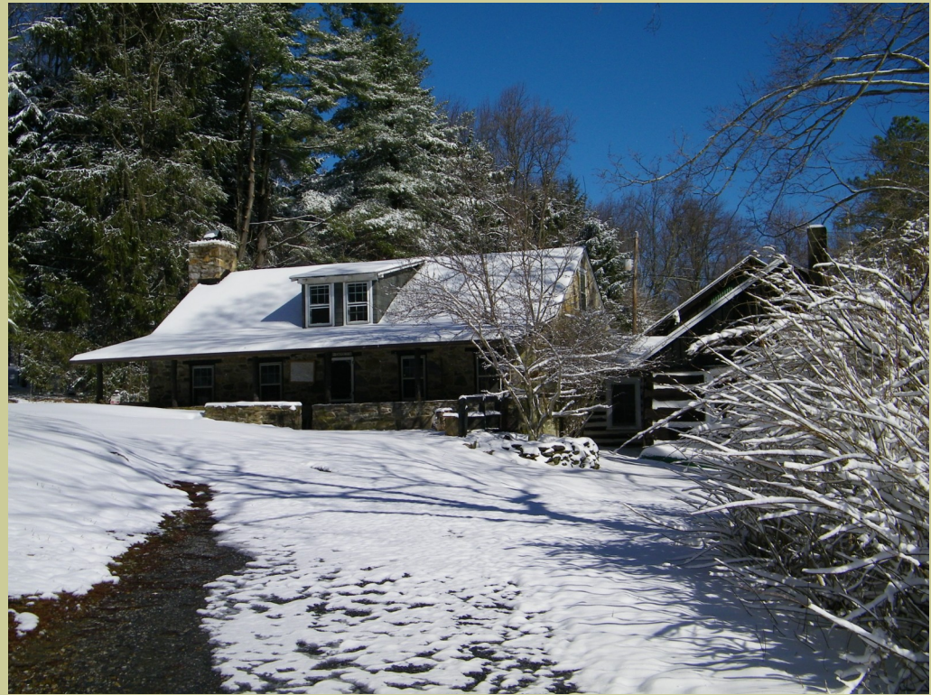
Catoctin Quaker Camp, Thurmont MD

As a highland wetland, Catoctin Quaker Camp is home to an endangered plant species. Because of this, part of camp is now protected land which assures that this area will remain beautiful wilderness for years to come.