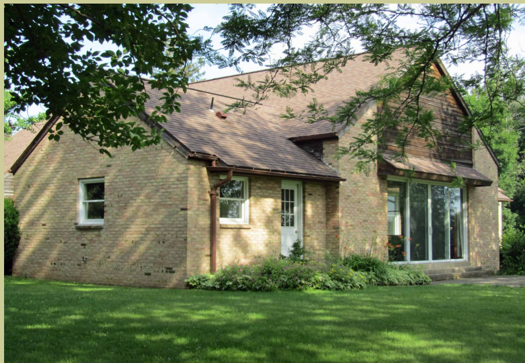
State College Meeting House, State College PA