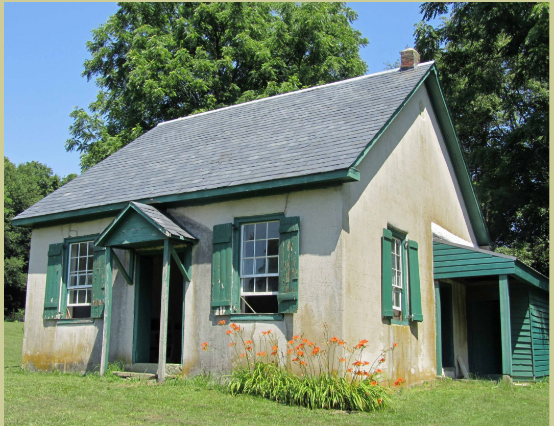
Little Elk Meeting House, Elk PA

Little Elk Meeting House was built in 1826 of stone and stucco. In 1909, it was covered with a skin of cement and marked into blocks. The Meeting House and Burial Ground are under the care of Nottingham Friends and the Stewards of Little Elk. Friends worship here once per month in the summer months.