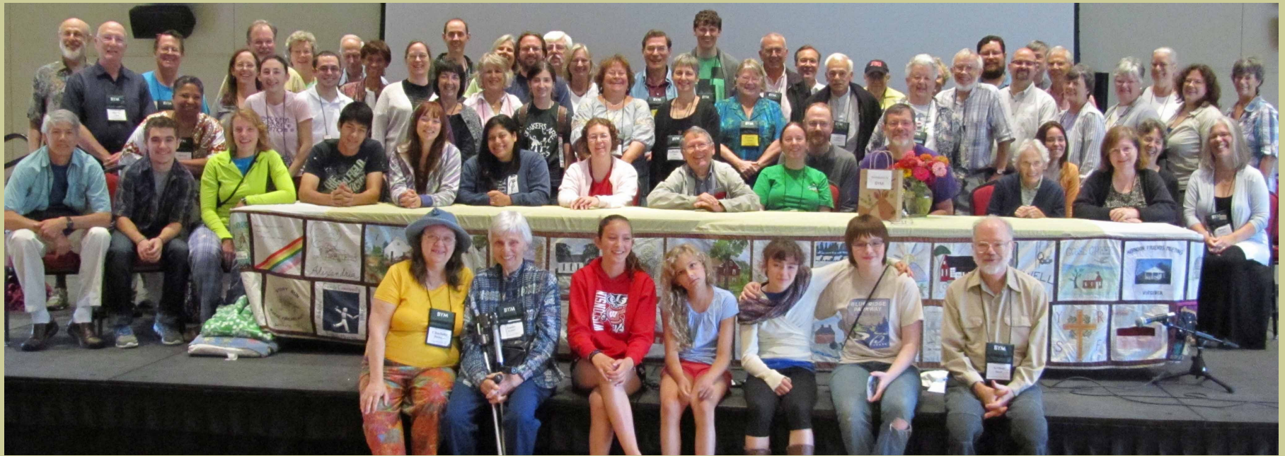
Friends at Baltimore Yearly Meeting's 342nd Annual Session