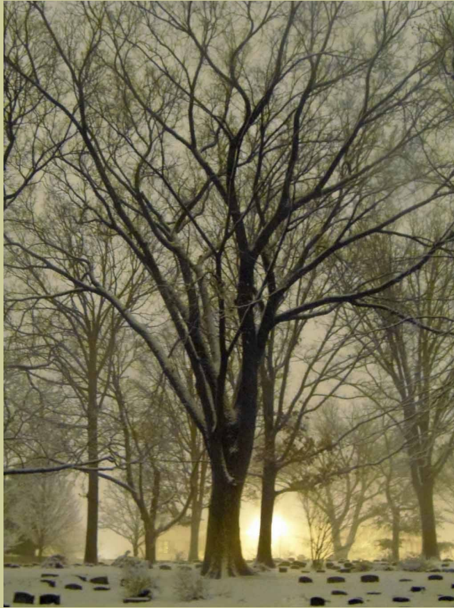
Friends Burial Ground, Baltimore MD