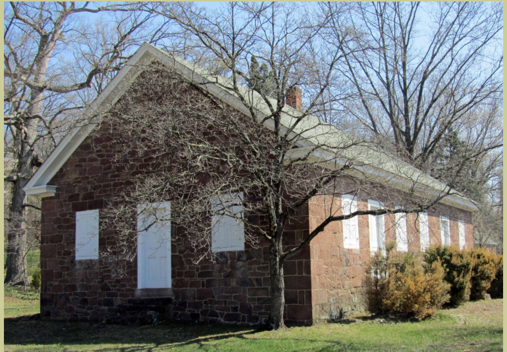
Redlands Meeting House, Newberrytown PA

The Newberry Worship Group meets in the Redlands Meeting House once per month in the warmer months. This stone Meeting House was built in 1811.