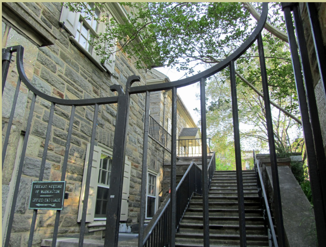
Friends Meeting of Washington, Washington DC

This Meeting House was designed and built particularly to accommodate President Herbert Hoover, a Quaker. The President and his wife, Lou Henry Hoover, attended the first Meeting for Worship held January 4, 1931. The First Lady was present at the laying of the cornerstone. Secret Service arrangements were less formidable then.