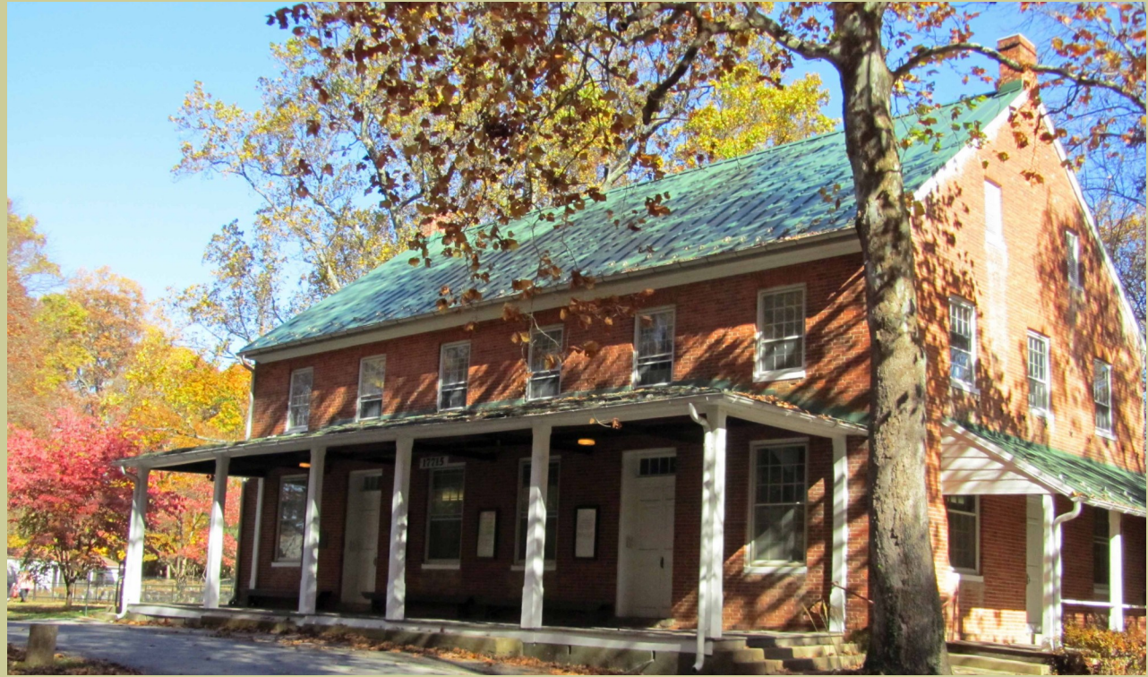
Sandy Spring Friends Meeting, Sandy Spring MD