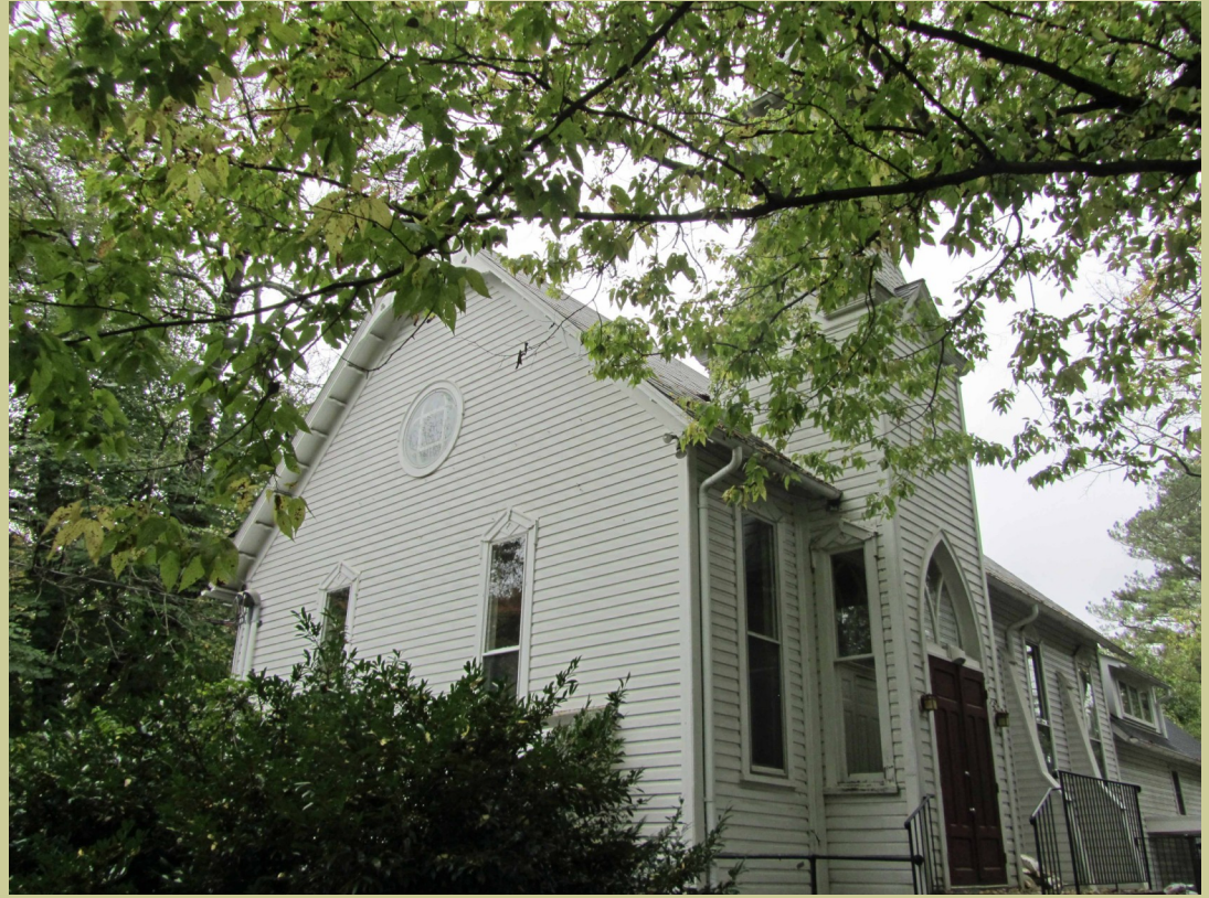
Langley Hill Friends Meeting, McLean VA

Built in 1893, this was originally the home of the Trinity Methodist Church. In 1957, it became home to the Lutheran Church of the Redeemer, which sold the building in 1961 to Friends Meeting of Washington for a preparative meeting under its care. Langley Hill Friends became a member Monthly Meeting of Baltimore Yearly Meeting in 1969. The building has undergone several renovations over the years.