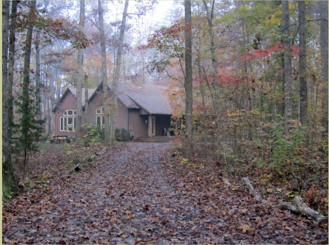
The Clearing, Amelia County VA