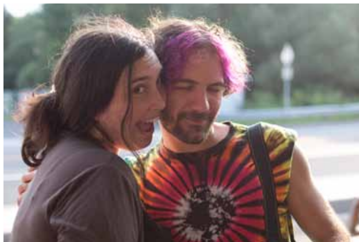
Annual Session

In this age of cell phones, we found paying for a phone line to the Meeting House in Oxford hard to justify. On the other hand, we do not want to lose opportunities for seekers to find out about our worship community. As an experiment, we are using Google Voice to provide a phone identity for the meeting (in Web listings, Friends Journal etc.). If you dial 484-758-0750, the call will ring the phone for several volunteers in the Meeting. If none of us answers, the call is shifted to voicemail and an email is sent to those volunteers, so one of us can attend to the call as quickly as possible. (We all too rarely remembered to check the old answering machine in the Meeting House.) Similarly, we've rigged the email address for the meeting ( info@oxfordfriends.org ) to forward to a circle of volunteers to ensure that inquiries receive attention. We'll keep you posted on how it works.