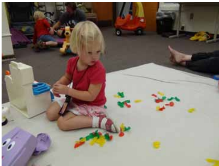
Annual Session