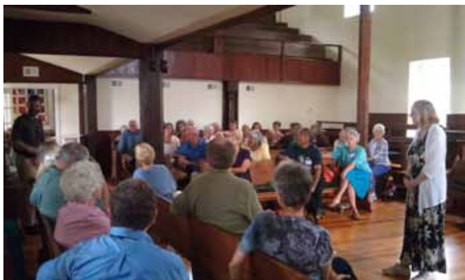
Hopewell Meeting House Homecoming 2012