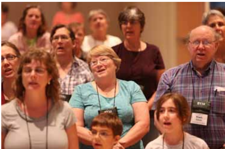
Annual Session

Junior Yearly Meeting gave us joy by coming for a visit, telling us what they are doing, and even singing for us!