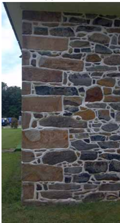
At the lovely historic Warrington Meeting in Wellsville, PA, it's set in stone. The building was originally built in 1769. This end is the new addition, built in 1782. Look from top to bottom to spell P-R-A-Y-E-R.