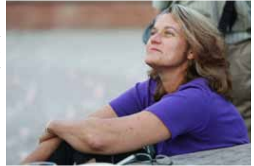
Annual Session

Divine manifests itself in our lives, and we hope our Faith & Practice will leave room for continuing revelation. Nor can we exactly articulate our Quaker practice, which often must be worked out with Divine as-