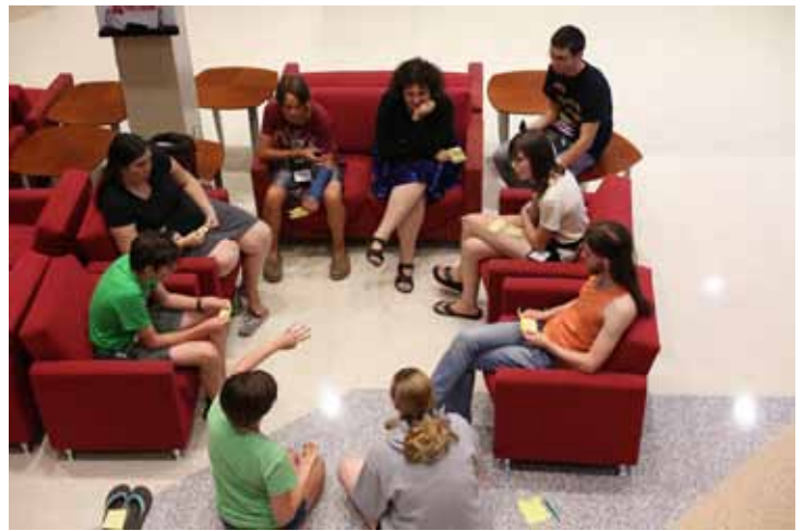
Annual Session

Quaker Quest is a dynamic and transformative inreach and outreach program based on the experience that the Quaker way is a spiritual path for our time that is simple, radical and contemporary. Quaker Quest started at Hampstead Meeting in London. Twelve Friends, who felt that something needed to be done to reverse the downward trend in numbers of Friends, started the program. Starting in 2002, they offer a session of Quaker Quest to the public every Monday night. In the early years they studied the sessions carefully and honed the process until they were happy the program. The London Friends took their show on the road in the United Kingdoms and many meetings did their own Quaker Quest programs. The meetings say that it has been generally very positive both in terms of spiritual growth and energy for the meeting and growth in numbers.