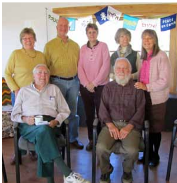
Friends of Mattaponi Friends Meeting

Mattaponi has its own spacious, sunny Meeting Room behind the barn on Dayspring Farm, which is committed to sustainable agriculture. Meet the horses and goats, and contemplate the flowers! "As we are present to the beauty, power, and cycles of nature we are inspired to know Spirit." – 2011 Spiritual State of the Meeting report. ( www.bym-rsf.org/who_we_are/meetings/va_meetings/mattaponi.html )