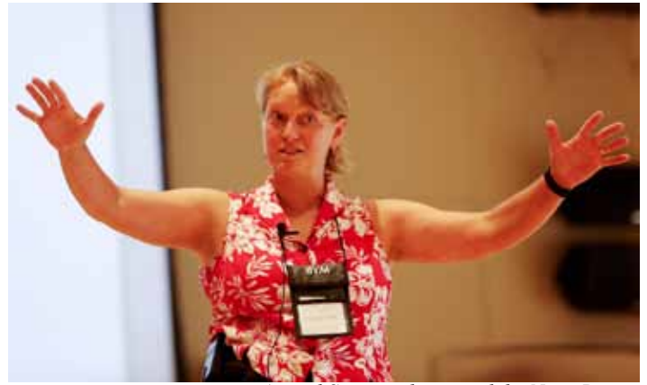
Annual Session

Throughout the week we have been made aware of many injustices that demand our attention. Not far from these beautiful hills, there are nonviolent activists being jailed and beaten for protesting against mountaintop removal. We were invited to visit an art exhibit drawing