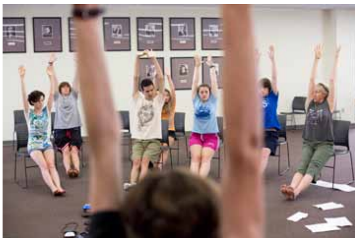
Annual Session