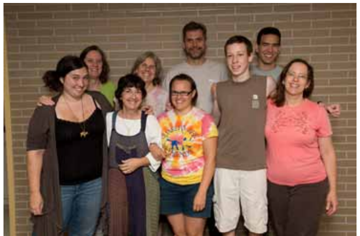
Youth Programs Committee